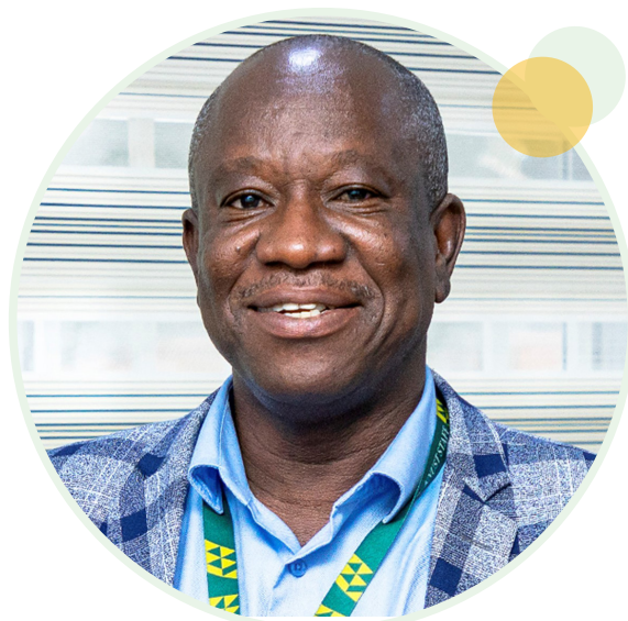
Director of Student Affairs

We encourage you to engage with the content,